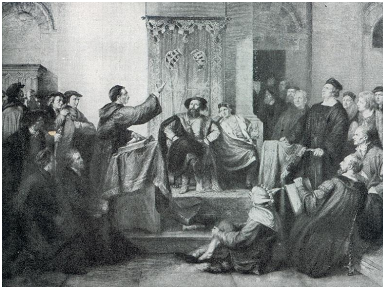
Martin Luther debates Johann Eck about Indulgences, Repentance, and Faith